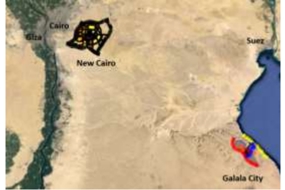
Figure (1): New Cairo and Galal City.

The paper hypothesizes that many of the challenges faced by these new cities are not novel but rather recurring issues that were not adequately addressed or lessons from previous experiences not implemented. For instance, problems related to infrastructure development, social inclusion, and traffic congestion have persisted despite the insights gained from earlier projects. However, the study also identifies new challenges that, while not present in earlier developments, were anticipated and can be effectively managed with proper planning and intervention. These new challenges may include adapting to climate change, integrating modern economic diversification strategies, and fostering community engagement in a rapidly changing urban environment. By contrasting the experiences of Galala City and New Cairo, the study seeks to draw valuable lessons that can inform future urban development initiatives in Egypt and similar contexts.