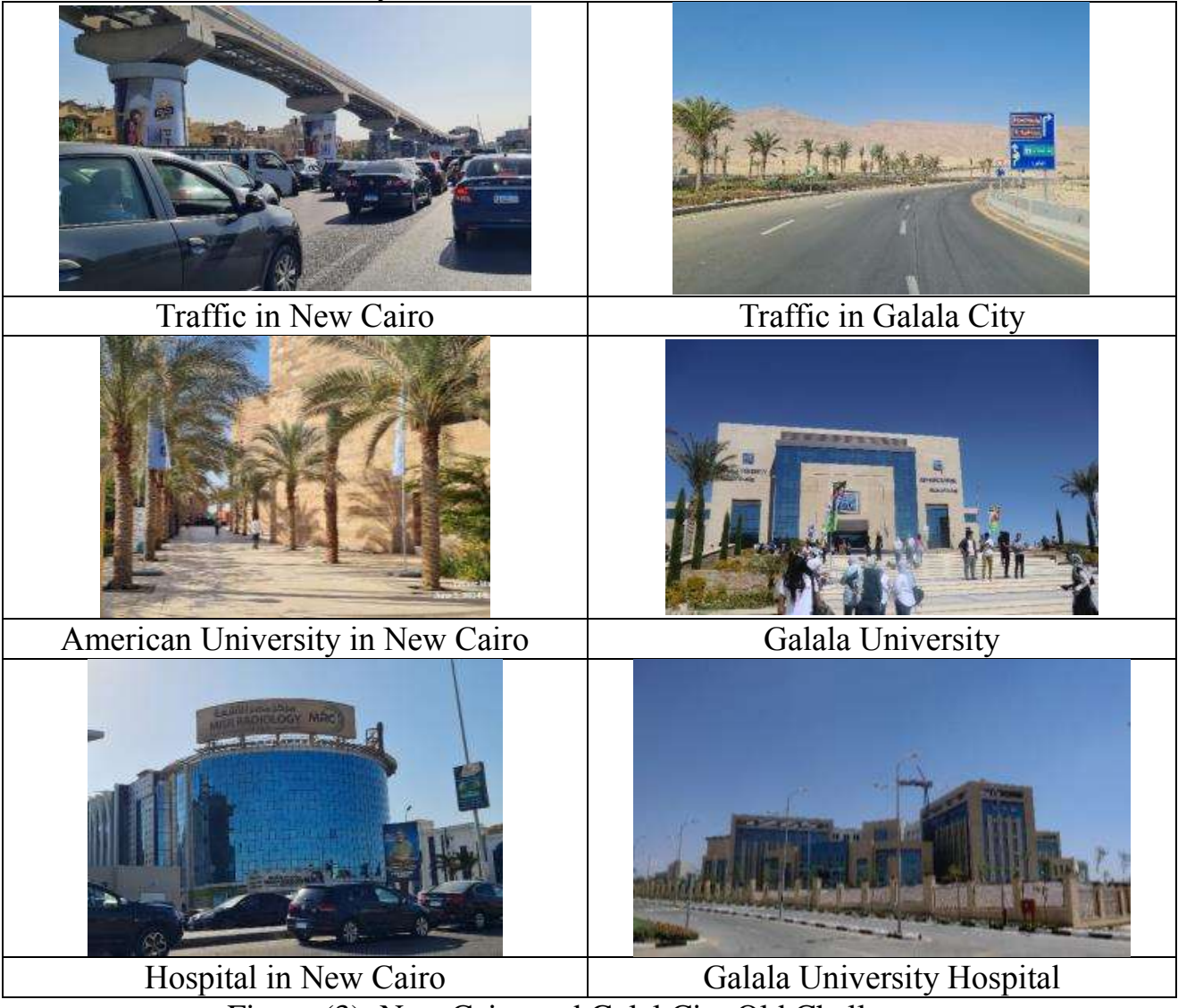
Figure (3): New Cairo and Galal City Old Challenges. Source: Author.

but instead impede local movement within the city and reduce the integration of its neighborhoods, turning them into isolated islands." (El-Khouly, Eldiasty, & Kamel, 2023) As Galala City develops, attention must be given to providing efficient transportation systems to serve the future population. Implementing smart mobility solutions and sustainable transportation options can help mitigate potential traffic congestion issues. Reducing traffic congestion through comprehensive urban planning and efficient public transportation systems contributes to lower carbon emissions and improved air quality. Implementing smart city technologies and sustainable transportation options can mitigate traffic issues and promote environmental sustainability.