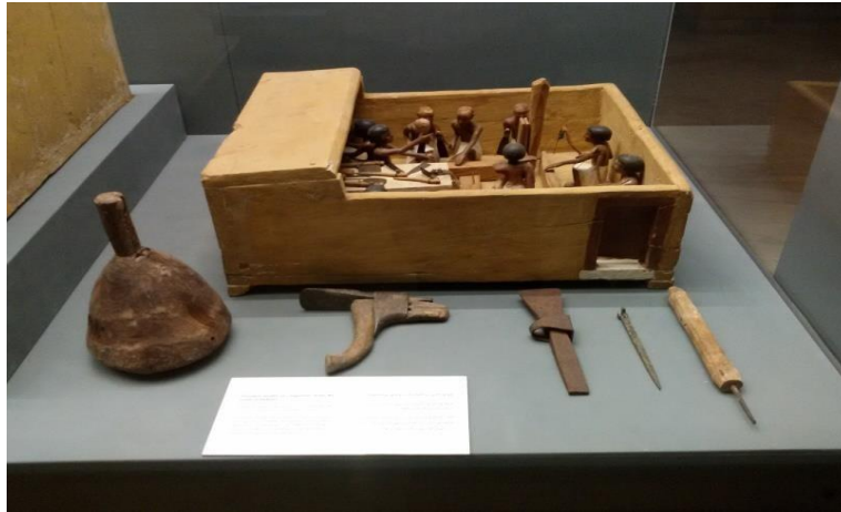
Fig. 10 - Carpentry Tools and a Model of Carpentry Workshop Displayed in the Temporary Gallery on the Egyptian Crafts.