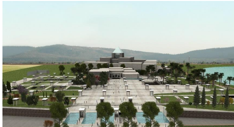
Fig. 1 - Overview of the National Museum of Egyptian Civilization.

through the ages; Work to raise awareness of Egyptian civilization and heritage to spread the spirit of loyalty, patriotism and pride in the homeland; Work to promote the spirit of loyalty and belonging between the museum and the surrounding environment; Highlight the community role of the museum and its interaction with the surrounding environment in order to revive these traditional crafts and preserve them from extinction; Interact with the community and its contemporary problems and issues awareness and participate in solving them for the development of society; Present a high-quality display that promotes manners, morals and general taste.