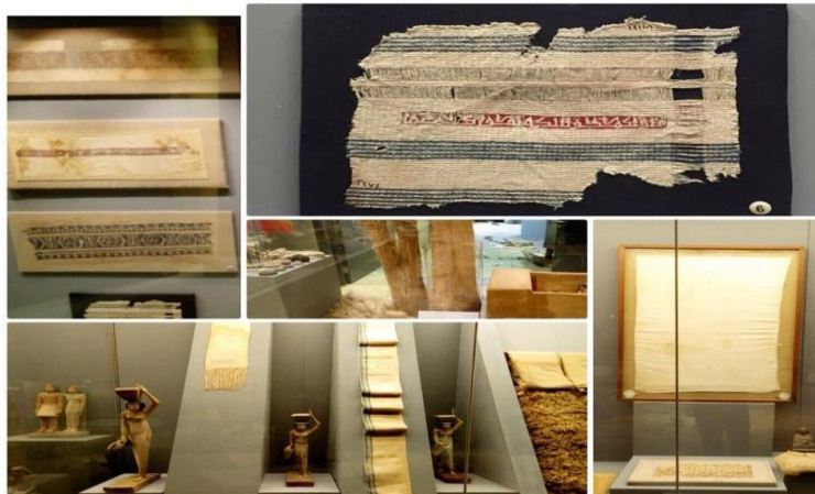
Fig. 8 - Textiles Items Displayed in the Temporary Gallery on the Egyptian Crafts.