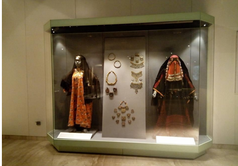
Fig. 12 - Traditional Jewelry of Nubia and Sinai Women Displayed in the Temporary Gallery on the Egyptian Crafts.