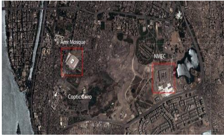
Fig. 2 - Alfustat Area Including the National Museum of Egyptian Civilization Site.