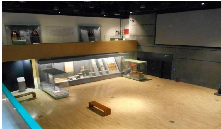
Fig. 7 - Textiles Displays in the Temporary Gallery on the Egyptian Crafts.