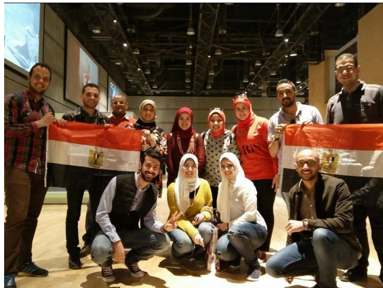
Fig. 13 - Visitors of the Temporary Gallery on the Egyptian Crafts Raising Egyptian Flags.