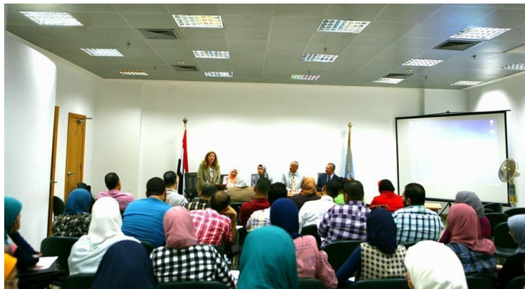
Fig. 3 - Training Under UNESCO.