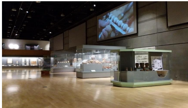
Fig. 6 - Pottery Displays in the Temporary Gallery on the Egyptian Crafts.