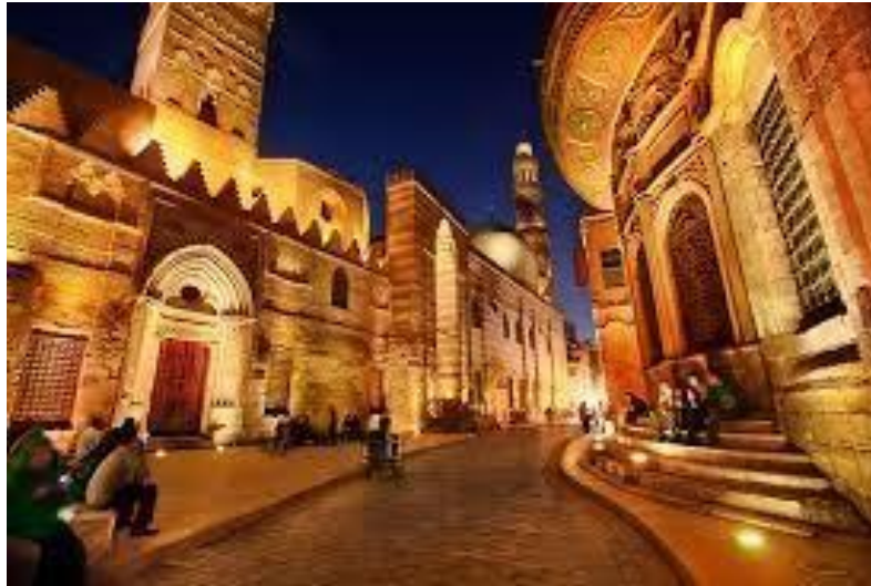
Figure (5): Al-Mu'izz Street, Sabil Al-Sultan.

Third, tourism has become the city's exclusive economy placing tremendous pressure on landowners, craftsmen and retailers to cater for the demand in tourism, thus leading to functional conversion.