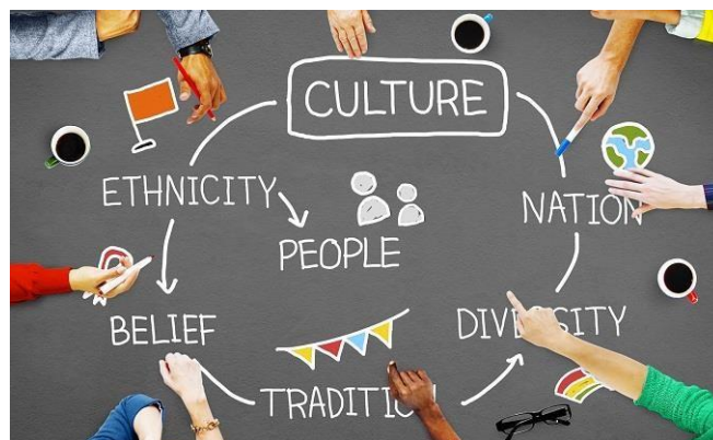
Figure (1): Cultural Diversity

Therefore, it is useful to stress the fact that culture is here to be understood in its widest sense. Indeed, from the outset we have been anxious for culture to be understood as being that which enables human beings to rise above nature or the way in which a people lives in society. The definition is therefore fairly broad, is not restricted to heritage alone and also incorporates the culture of the daily lived experience of whole peoples. ix