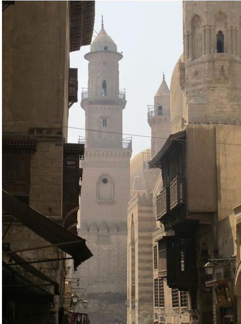
Figure (4): Al-Mu'izz Street, Katkudah, Beshtak.

cities, where tourist activities and the growing number of tourists induce changes in urban form, in the physical structures, in the functional patterns and in the use of public space. Also, it has shown that different tourist activities have had a physical impact on the artifacts of the urban environment. Tourists visiting historical cities are attracted by the spatial concentration of historic buildings as a setting for sightseeing and the range of opportunities for related cultural activities.