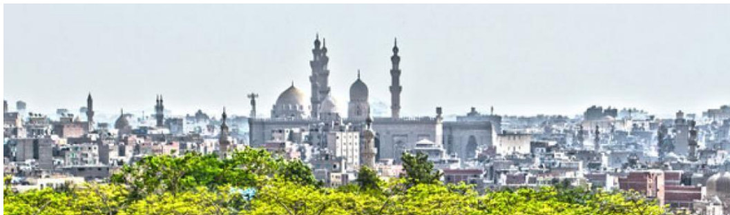
Figure (2): Historic Cairo

On the other hand, Identity is linked to ‘senses of time’ and atavistic fears in that it is not ‘secured by a lifelong guarantee’ and is ‘eminently negotiable and revocable’ (Bauman, 2004). The term refers to the ways in which markers such as: heritage; language; religion; ethnicity; nationalism; and shared interpretations of the past, are used to construct narratives of inclusion and exclusion that define communities and the ways in which these latter are rendered specific and differentiated. xv Conceptual complexities has given both heritage and identity, the interrelationships between them are multi-faceted and both spatially and temporally variable.